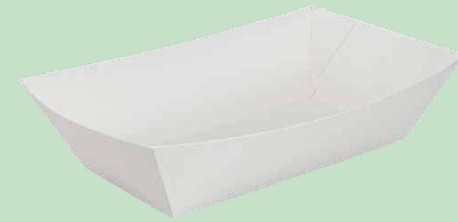
500ml Boat Tray 300GSM White | 2000Ctn