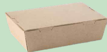
500ml Food Box 300 GSM Kraft Brown | 500Ctn 145mm x 104mm x 40mm