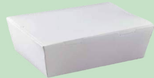
500ml Food Box 270/300 GSM FiloP White | 500Ctn 145mm x 104mm x 40mm