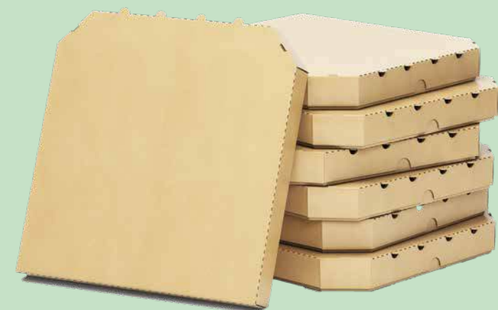
11" Pizza Box

White / Brown | 200Ctn 10" x 10" x 1.75"