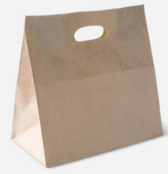
D-Cut Bag | 280 x 280 x 150 C040S0010B Brown | 500Ctn