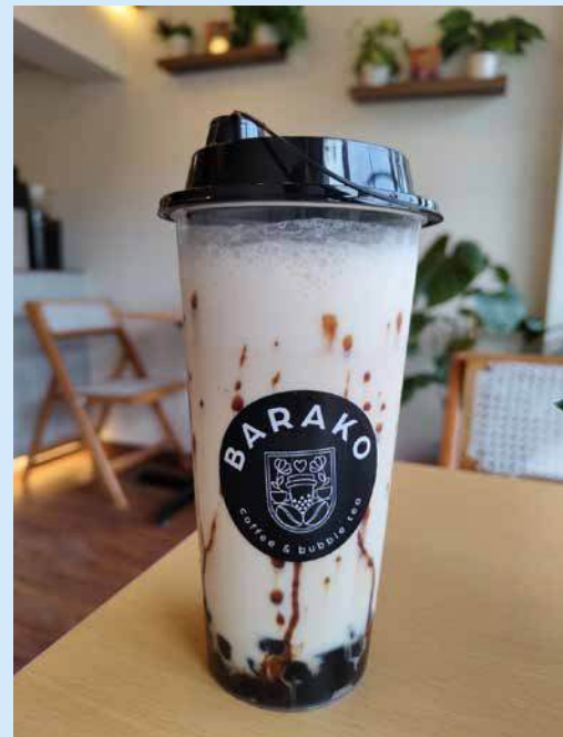
350ml Packnserve Cup PP Clear | 2000Ctn