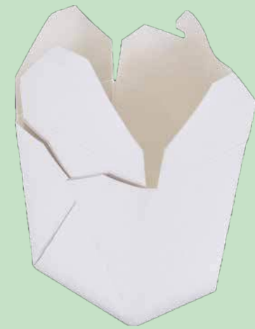
230ml Pail Box 270/300 GSM FiloP White | 1000Ctn