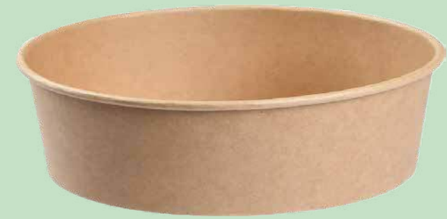
500ml Salad Bowl 300GSM Kraft Brown | 300Ctn Fits 148mm Lid