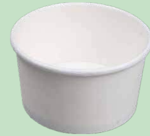
100ml Paper Tub