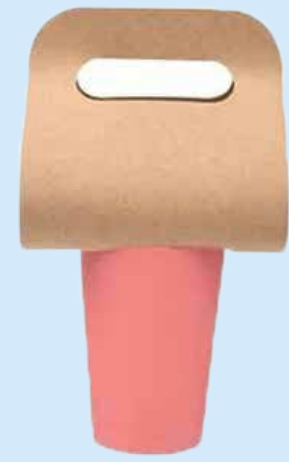
Single Cup Holder Brown Kraft 300GSM Brown | 5000Ctn