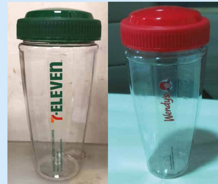
330ml PET Bottles PET Clear | 198Ctn