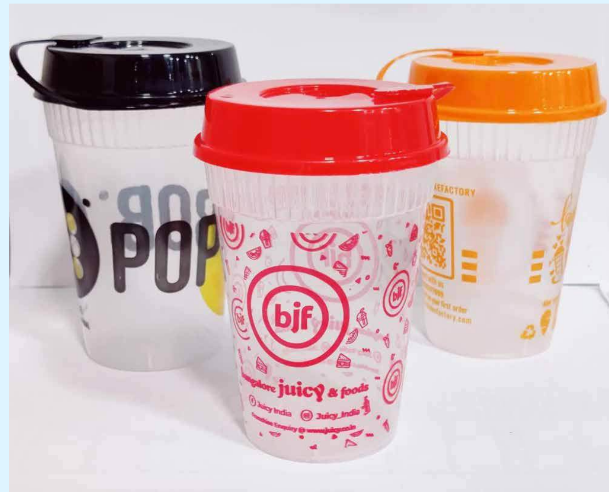
350ml Shake Cups with Branding