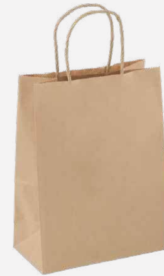
PTH#3 Bag | 200 x 180 x 130 C808S0010 Brown | 250Ctn