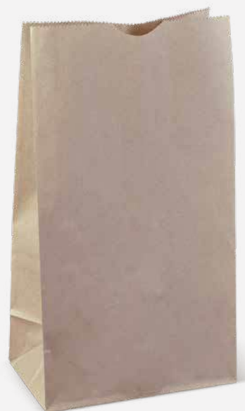
SOS#6 Paper Bag | 273 x 150 x 90 C582S0010A Brown | 2000Ctn | 500 Slv