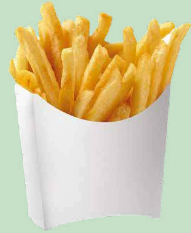
Fries Box - Standing 300GSM FBB White/Brown | 1000Ctn Custom Size

Customize your boxes with ease. Refer Pg.27