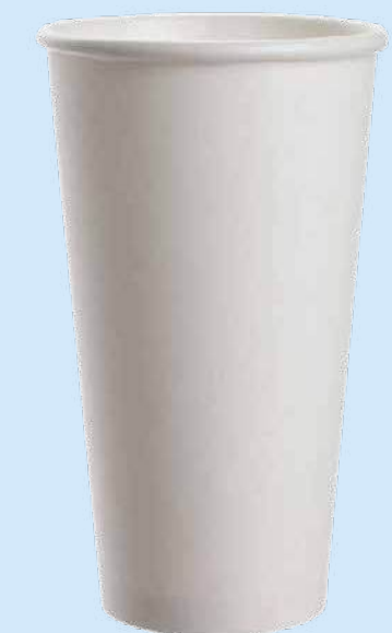
22oz | 650ml SWPLA650 | PLA Coated Plain White | 1000Ctn