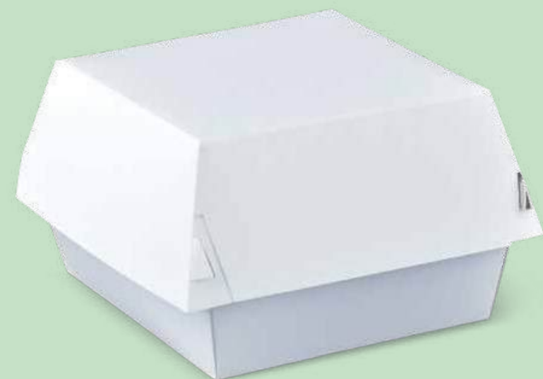
Large Burger Clam 300GSM FBB White | 400Ctn 110 x 116 x 86 (L x W x H)

Customize your boxes with ease. Refer Pg.27