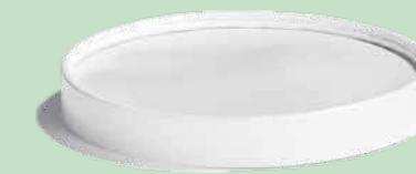
80mm Paper Lid