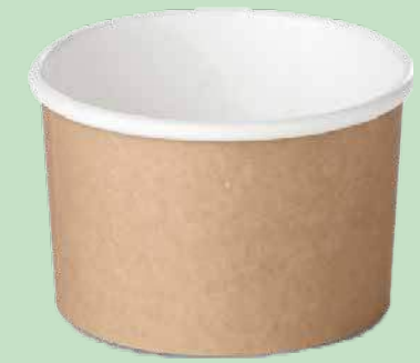
250ml Paper Tub