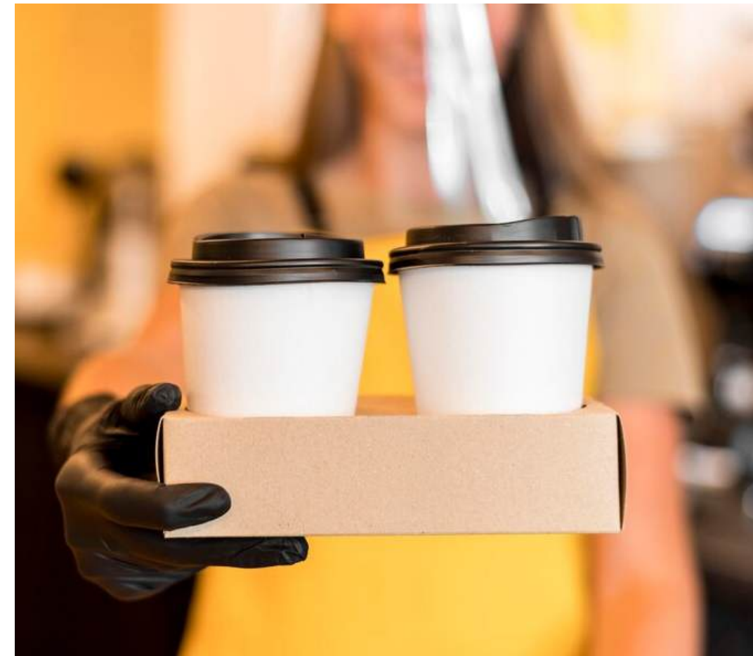
Cups & Accessories