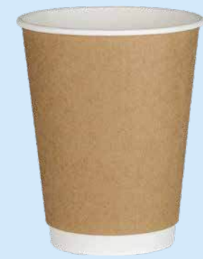
8oz | 250ml DWPE250B | PE Coated Brown Kraft | 1000Ctn Fits 80mm Lid