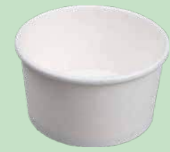
50ml Paper Tub