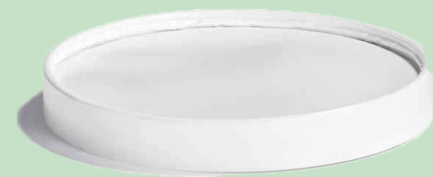
115mm Paper Lid

White | 500Ctn Fits 300/500/750ml Paper Tub