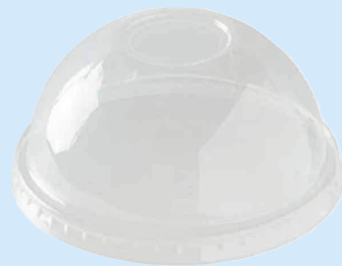
90mm PLA Dome DM90PLA | PLA Clear | 1000Ctn