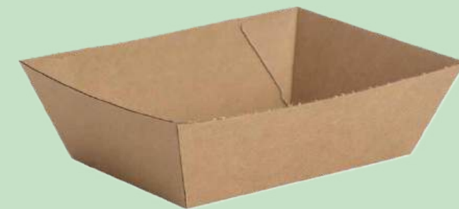
500ml Boat Tray 300GSM Kraft Brown | 2000Ctn