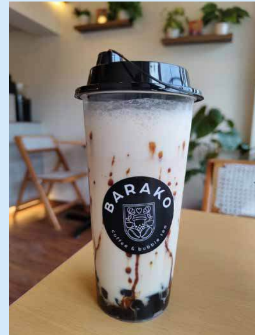
500ml Packnserve Cup PP Clear | 2000Ctn