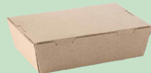
750ml Food Box 300 GSM Kraft Brown | 500Ctn 165mm x 114mm x 45mm