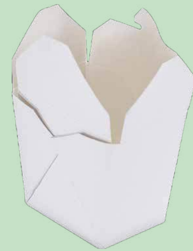
500ml Wok Box 300 GSM FiloP White | 700Ctn