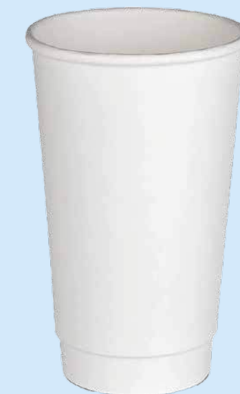
16oz | 450ml DWPE450W | PE Coated White | 500Ctn Fits 90mm Lid