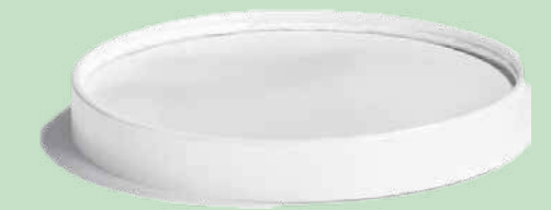
95mm Paper Lid