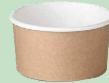
150ml Paper Tub