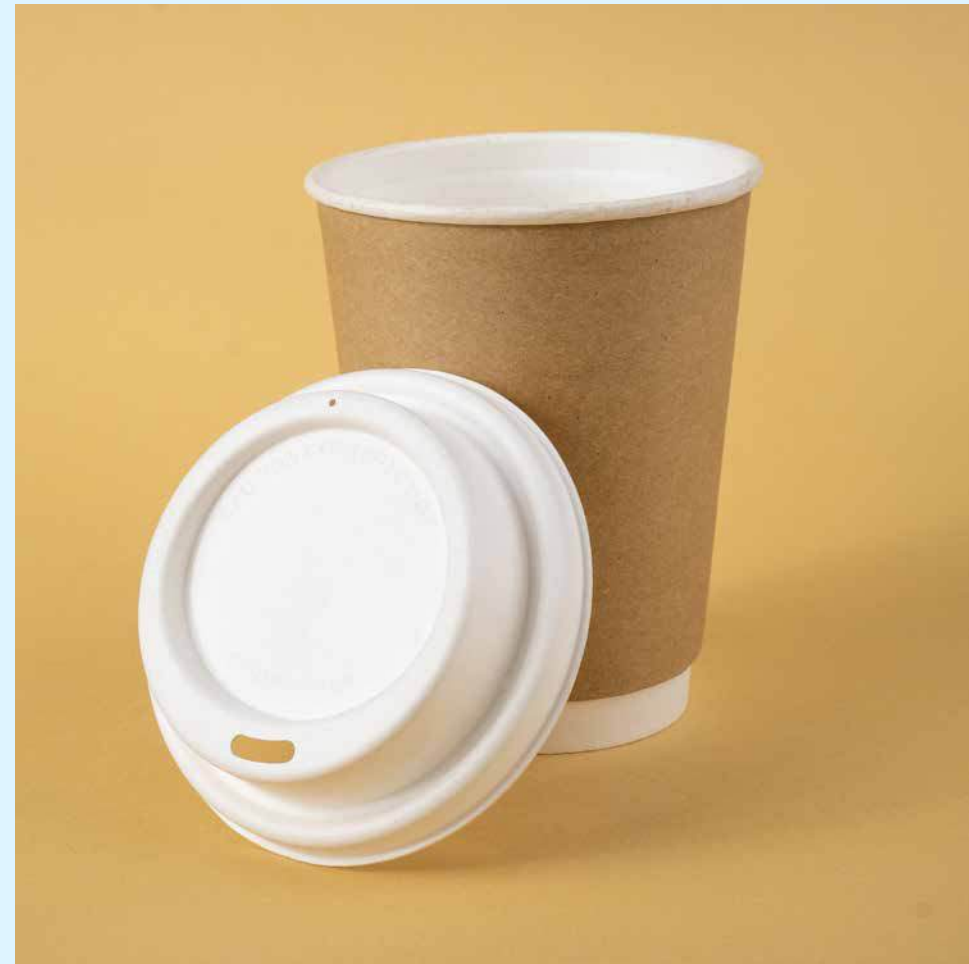
Double Wall Cup with Bagasse Lid