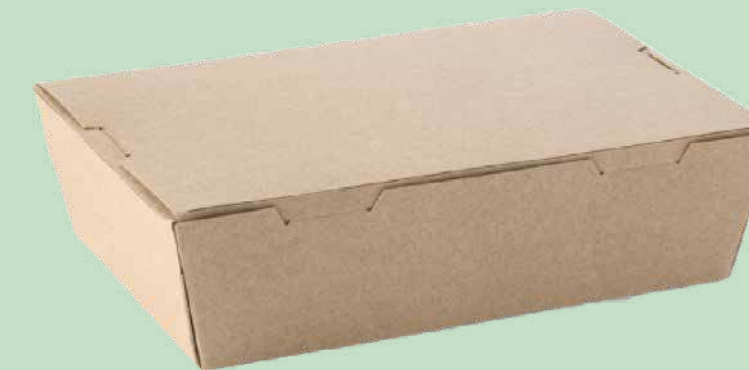
1000ml Food Box 300 GSM Kraft Brown | 500Ctn 200mm x 140mm x 50mm