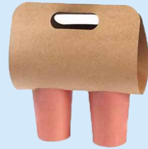
Double Cup Holder Brown Kraft 300GSM Brown | 5000Ctn