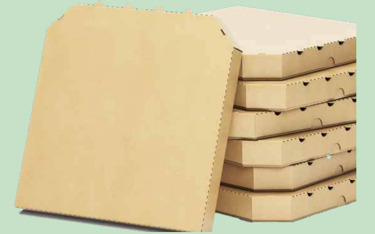
10" Pizza Box -

White / Brown | 200Ctn 10" x 10" x 1.75"