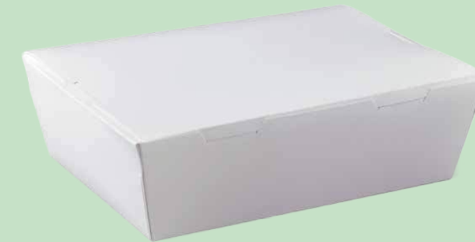
1000ml Food Box 270/300 GSM FiloP White | 500Ctn 200mm x 140mm x 50mm