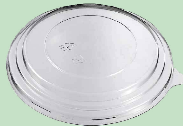
184mm Dia PET Lid

Clear | 300Ctn Fits 500/750/1000ml Salad Bowl