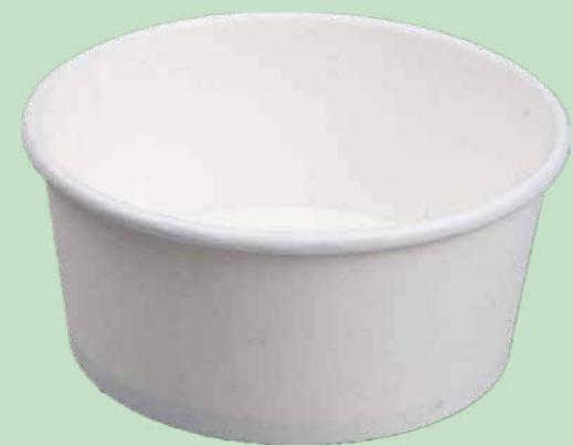
300ml Paper Tub