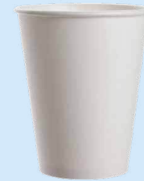
8oz | 250ml SWPLA250 | PLA Coated Plain White | 2400Ctn