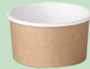
100ml Paper Tub