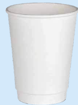
8oz | 250ml DWPE250W | PE Coated White | 1000Ctn Fits 80mm Lid