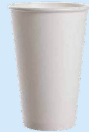
10oz | 300ml SWPLA300 | PLA Coated Plain White | 2400Ctn