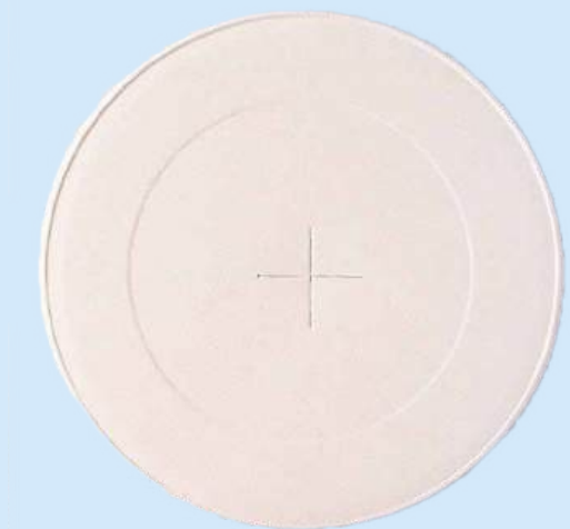
90mm Paper Lids StrawCut SC90P | PAPER White | 1000Ctn