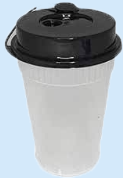
250ml Shake Glass PP Clear | 1000Ctn