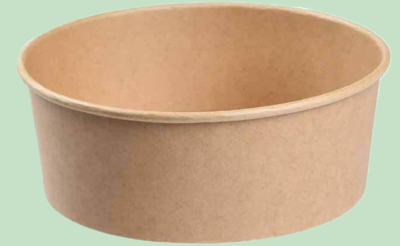
1300ml Salad Bowl 300GSM Kraft Brown | 300Ctn Fits 184mm Lid