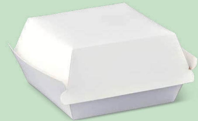
Small Burger Clam 300GSM FBB White | 400Ctn 106 x 106 x 69 (L x W x H)