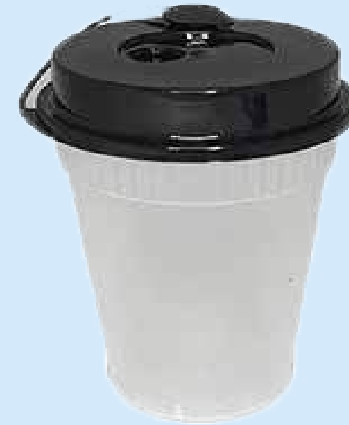
500ml Shake Glass PP Clear | 1000Ctn