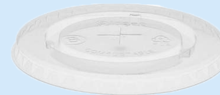
90mm PET Straw Cut SC90PET | PET Clear | 1000Ctn