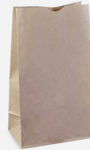
SOS#B Paper Bag | 240 x 127 x 77 C545S0010A Brown | 1000Ctn | 500 Slv