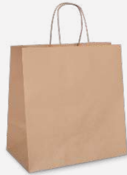
PTH#D Bag | 280 x 280 x 150 C280S0010 Brown | 250Ctn