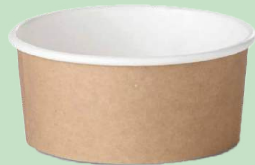
300ml Paper Tub