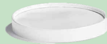
73mm Paper Lid