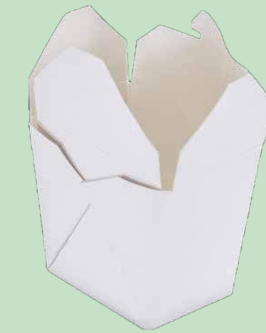
1000ml Wok Box 300 GSM FiloP White | 500Ctn