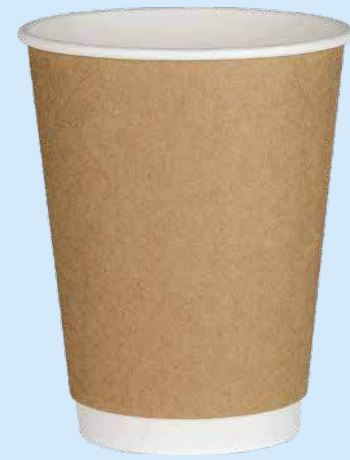
12oz | 350ml DWPE350B | PE Coated Brown Kraft | 1000Ctn Fits 90mm Lid