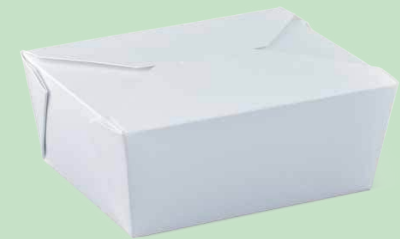
1500ml Food Box 300 GSM Kraft White | 300Ctn