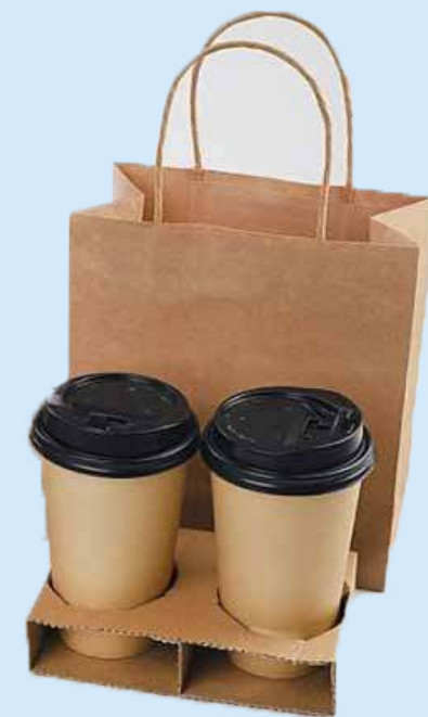
Paper Bag with 2 Drink Holder Brown Kraft 300GSM Brown | 2000Ctn