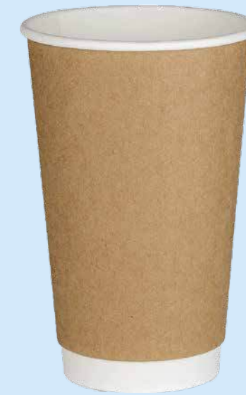
16oz | 450ml DWPE450B | PE Coated Brown Kraft | 500Ctn Fits 90mm Lid