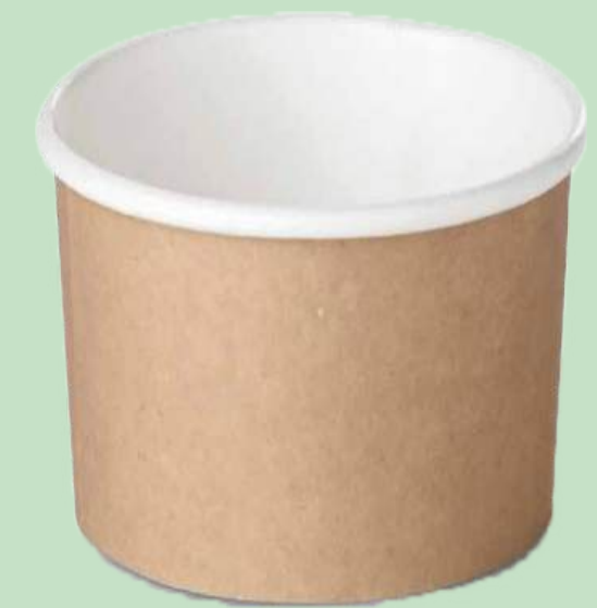
750ml Paper Tub