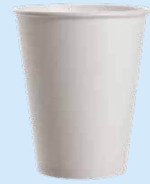
4oz | 120ml SWPLA120 | PLA Coated Plain White | 5000Ctn