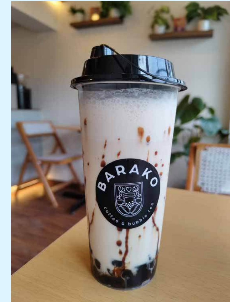
500ml Packserve Cup