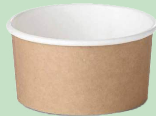
400ml Paper Tub