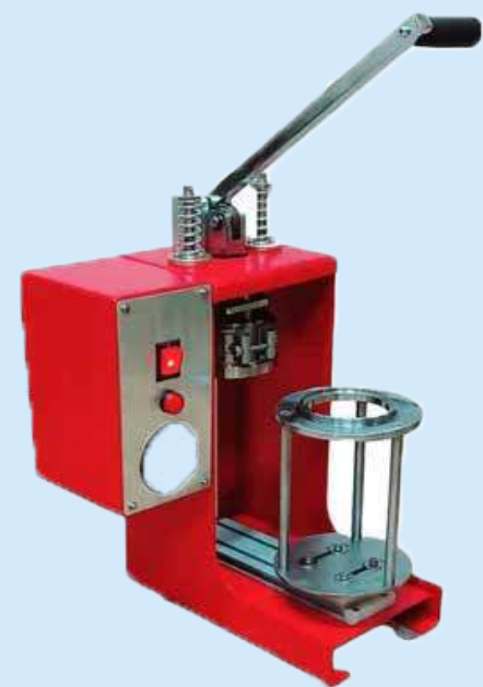
Cup Sealer Machine 80/90mm Cup Sealer Red | 1Ctn