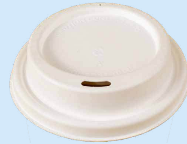
90mm Bagasse Lids BG90 | Soft-Hard Wood Natural | 1000Ctn