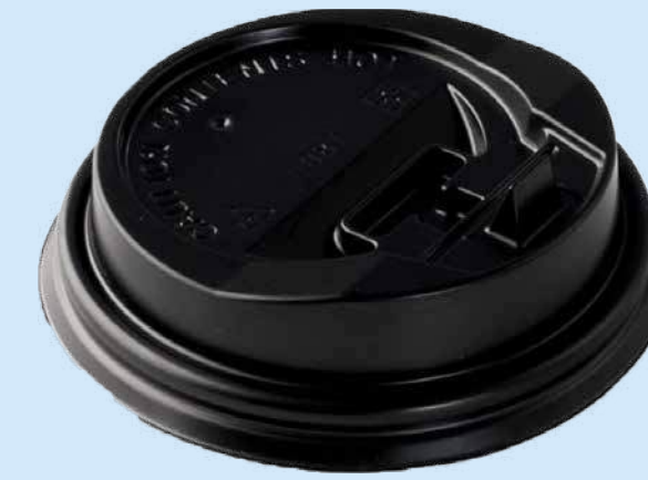
80mm PS Sipper PS80S | PS Black | 5000Ctn