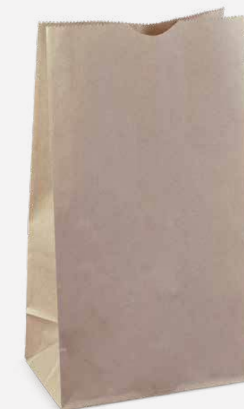
SOS#Large Bag | 305 x 300 x 180 C793S0010 Brown | 250Ctn | 250 Slv