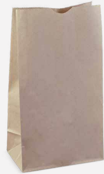
SOS#8 Paper Bag | 305 x 150 x 95 C763S0010 Brown | 2000Ctn | 500 Slv