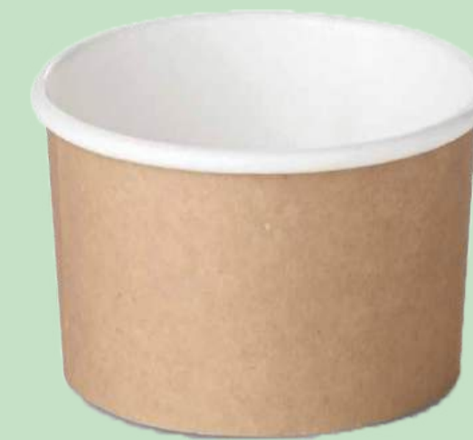
500ml Paper Tub