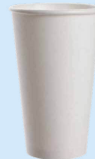
20oz | 600ml SWPLA600 | PLA Coated Plain White | 1000Ctn