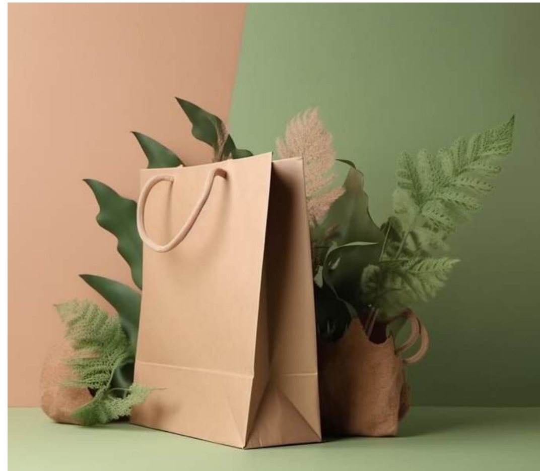
Paper Carry Bags