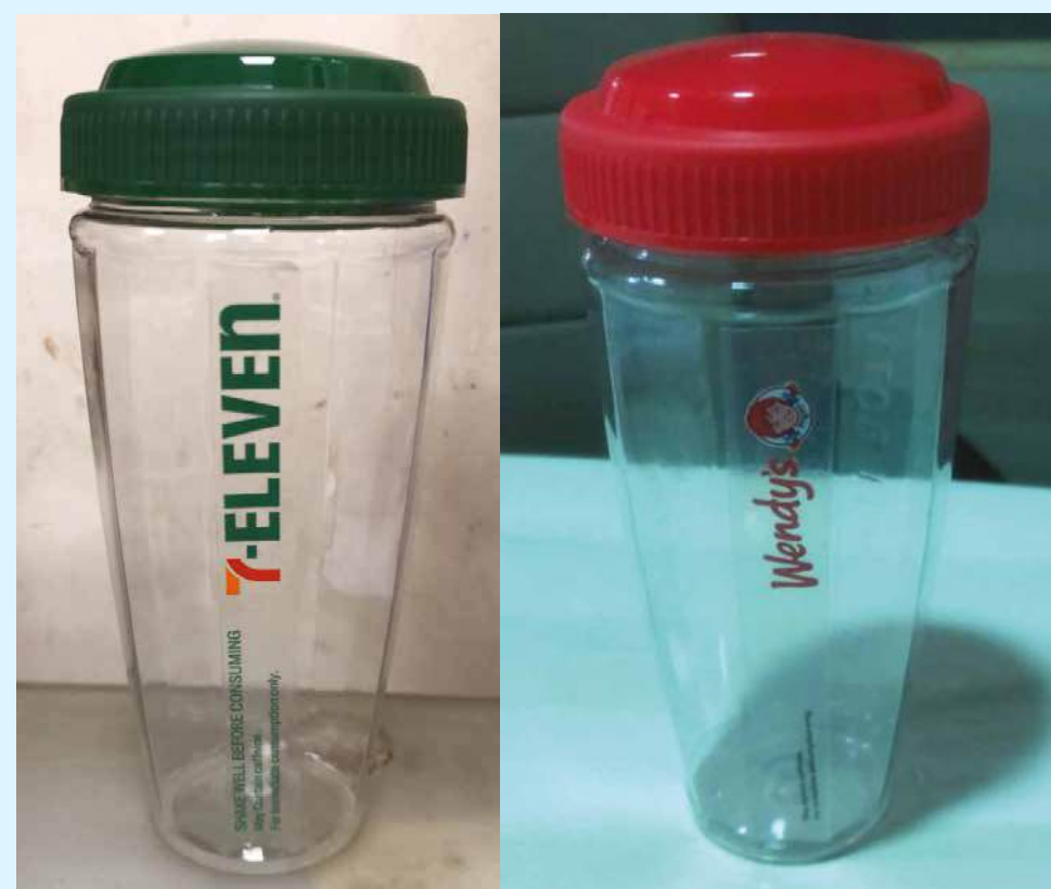
330ml PET Bottles with branding