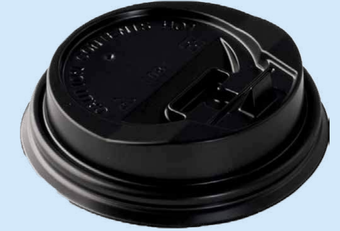
90mm PS Sipper PS90S | PS Black | 5000Ctn