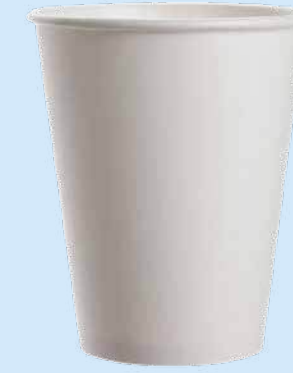
8oz | 250ml SWPE250 | PE Coated Plain White | 2400Ctn