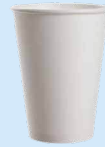
6oz | 180ml SWPLA180 | PLA Coated Plain White | 3000Ctn