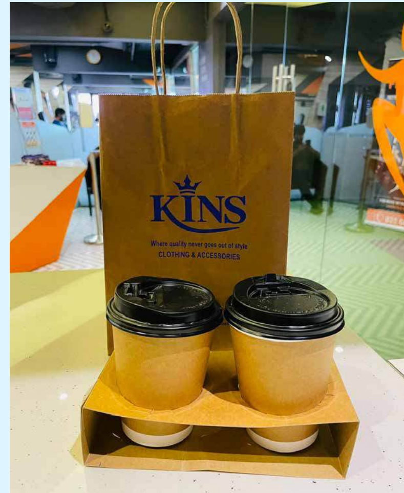
PTH Bag with Two Cup Holder