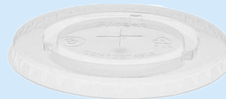
90mm PLA Straw Cut SC90PLA | PLA Clear | 1000Ctn