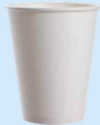
12oz | 360ml SWPLA360 | PLA Coated Plain White | 1000Ctn